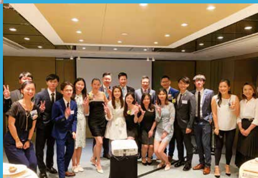
▲ 3.6 Academic Achievement Award