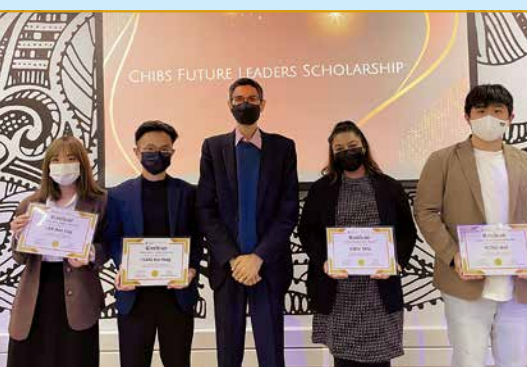
▼ GBM High Table Dinner

就讀本系的學生成績非凡，奪得不少聯校比賽獎項及卓越獎學金。本課程特別設立獎學金予表現優秀的同學。學生可參加本系及大學舉辦之各類課外活動以結合理論和實踐。包括 GBM 高桌晚宴、Global Bravo Meet、專業導師計劃、手工藝工作坊、管理系聯賽。