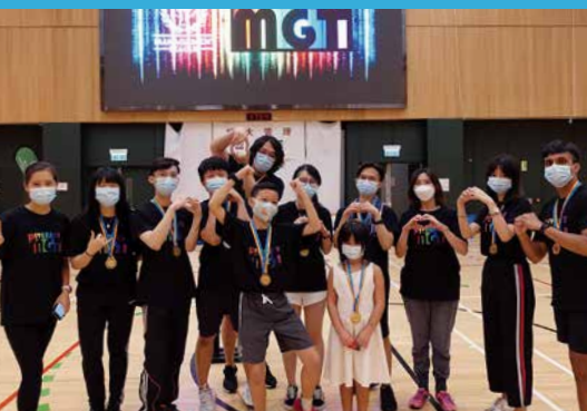
◀ Student Activities & Workshop