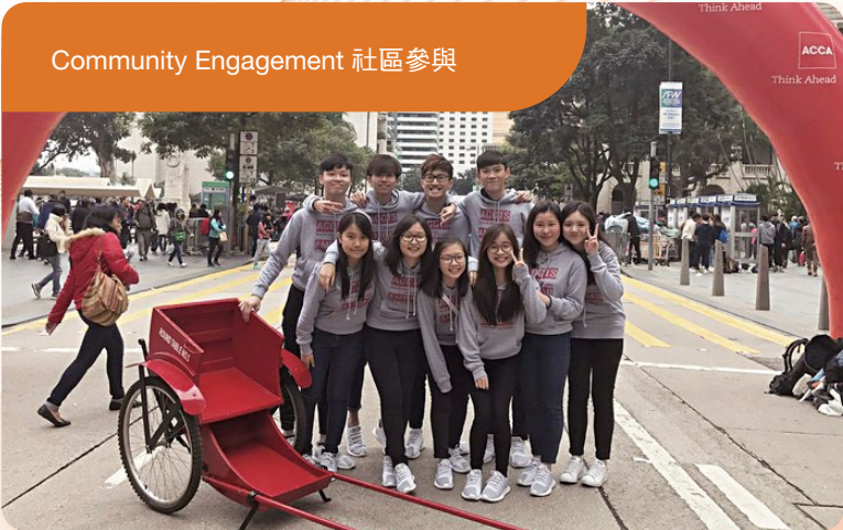
Community Engagement 社區參與