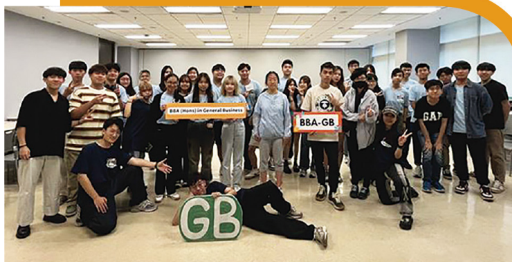
Orientation Day & Student Association