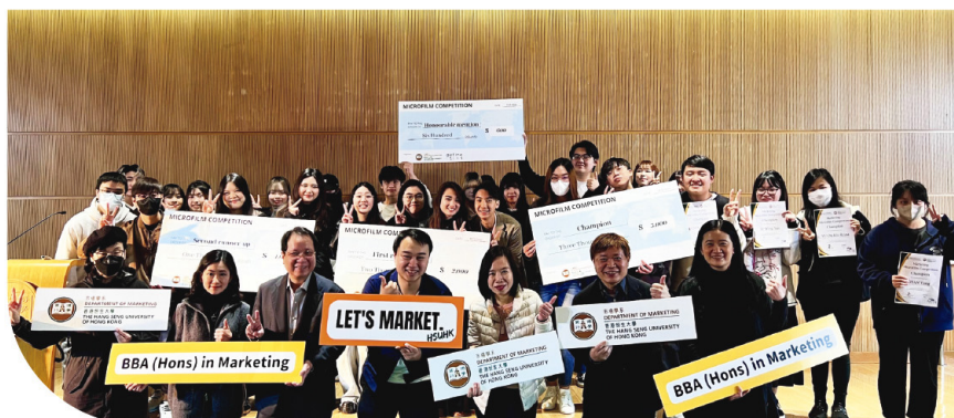
HSUHK x define CLEAN - Microfilm Competition