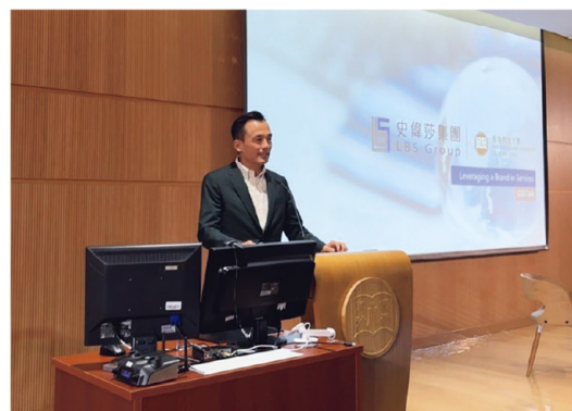
CEO Talks – LBS Group