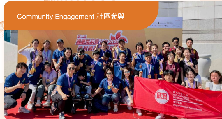
Community Engagement 社區參與