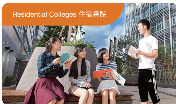
Residential Colleges 住宿書院