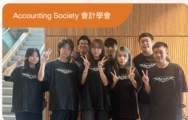
Accounting Society 會計學會